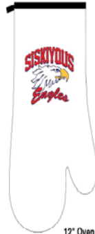
12" Oven Mitt