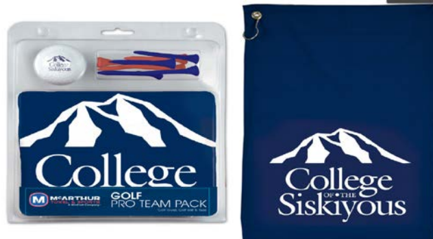
Hole- in-One Golf Set