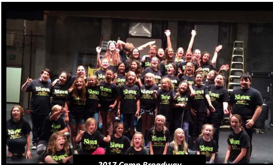
2017 Camp Broadway