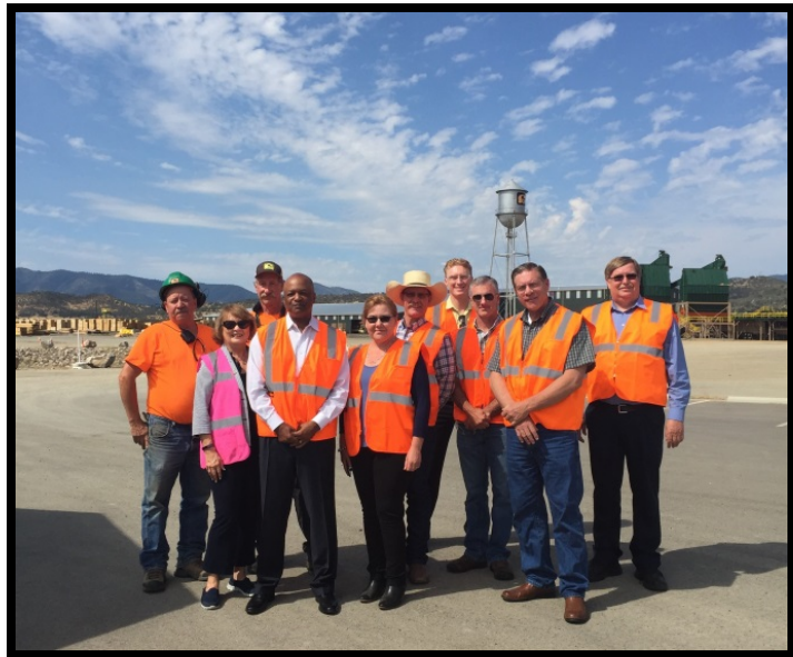
Senator Advisor Visit

Many topics were discussed that directly affect our communities here in rural Siskiyou County. Among the different topics, College of the Siskiyous was a critical component of many of the themes. The role our community college can play in areas such as strong workforce development, training for employment skills, apprenticeships, and post-secondary education is key for future survival of our industries and promoting career pathways in Career and Technical Education for the next generation.